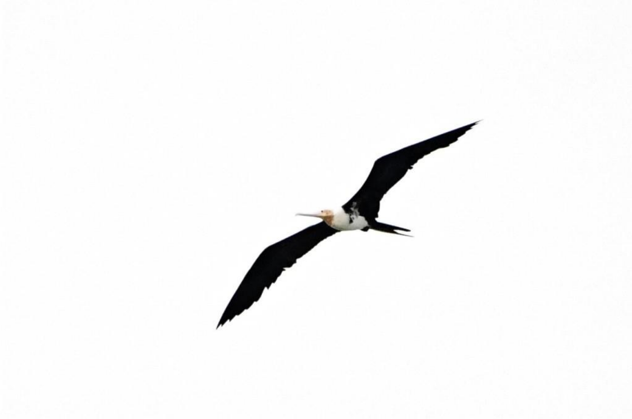
Christmas Frigatebird Fregata andrewsi over Marine East on 26 Jan 2022.