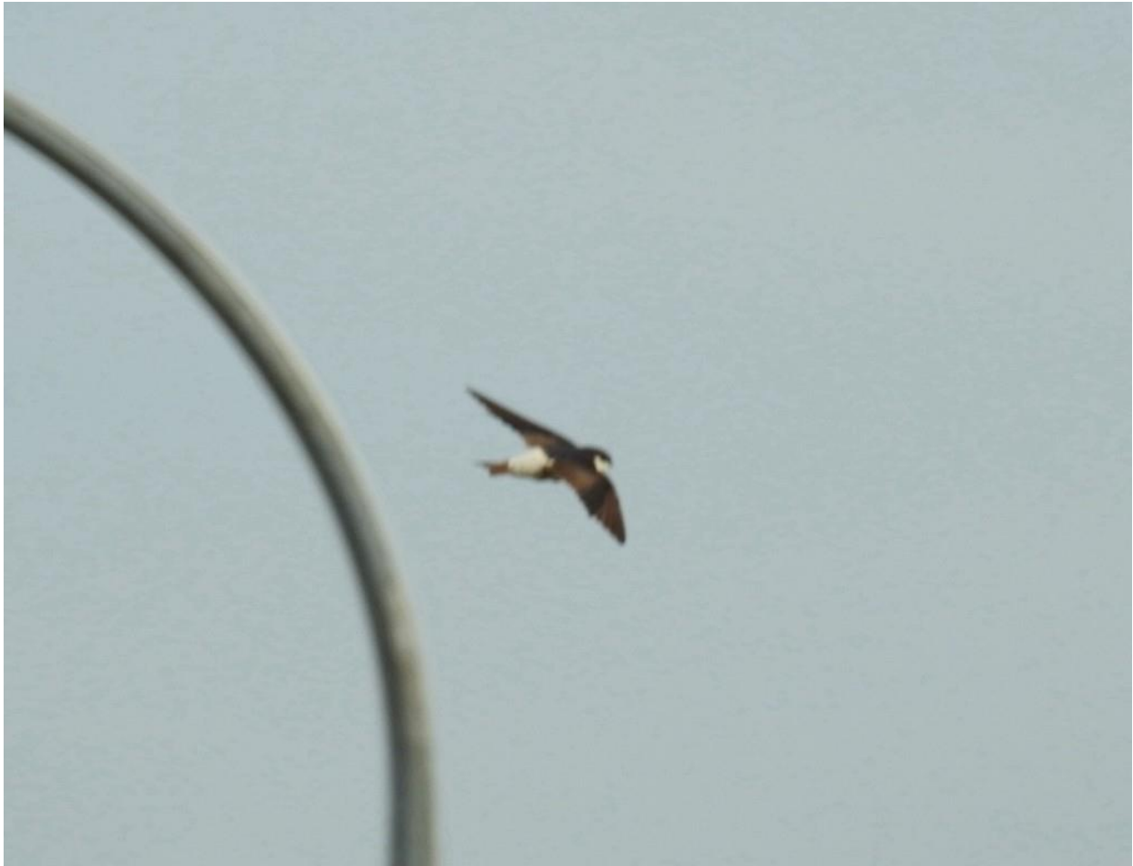
Siberian House Martin Riparia lagopodum over Harvest Lane on 3 Jan 2021.