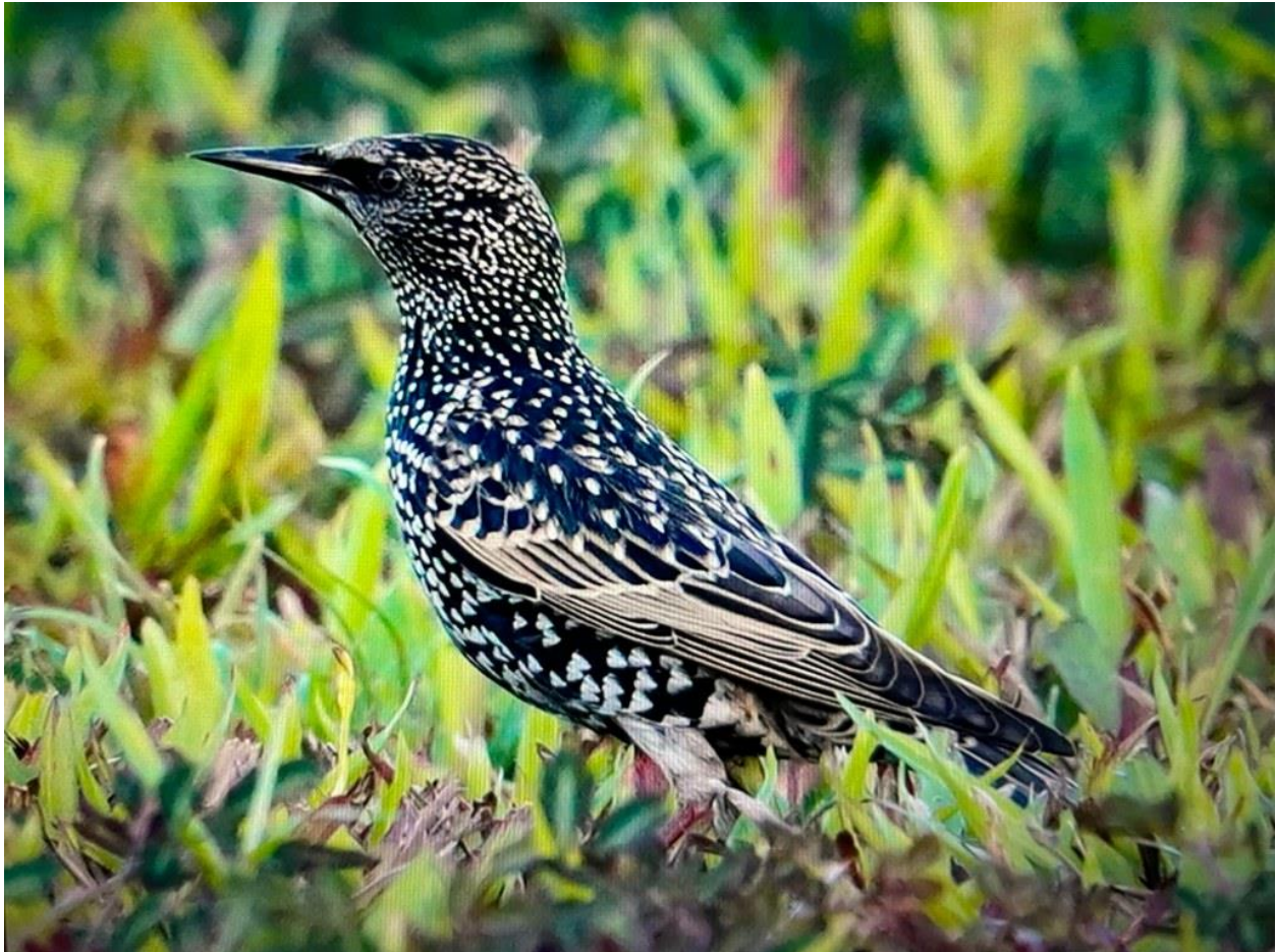
Common Starling Sturnus vulgaris at Marine East on 13 Dec 2021.

An adult seen at Marina East Drive on 13 December 2021 by Gabriel Koh and subsequently by many other observers was the first record for Singapore. It breeds in Europe and the Palearctic eastwards to Mongolia. Northern populations are migratory and winters south to Spain and Africa. It has also been introduced to Australia, New Zealand, North America, Mexico, Argentina, South Africa and Fiji. 12 subspecies have been described.