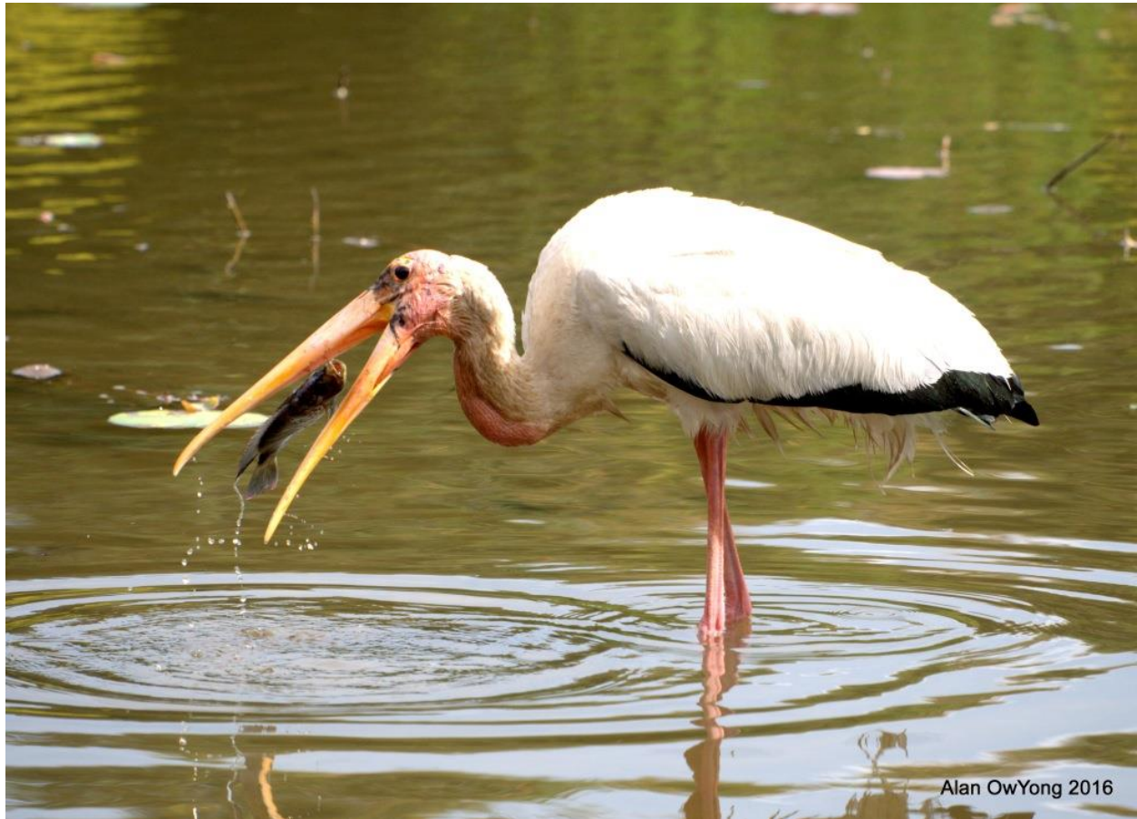
Milky Stork Mycteria cinerea at Chinese Gardens.

Previously in Category E (Lim 2009). The Milky Stork is a monotypic species with a range covering the Thai-Malay Peninsula, Indochina, Greater Sundas and Sulawesi (Clements 2007). It was first reported in Singapore when 2 birds were reported on 9-22 September 1997 at Seletar Farmway (Lim 2009). The birds were believed to be free-flying birds from the Zoo. Subsequently, sightings became regular in the north and northwest of Singapore. Breeding has not yet been reported outside the Zoo but juveniles are frequently seen and are indicative of local breeding.