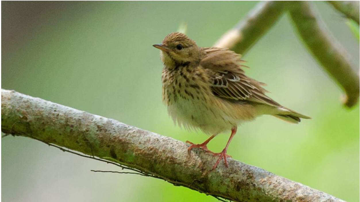
Tree Pipit Anthus trivialis at Ulu Pandan PC, besides Clementi Road, on 23 Oct 2021.

One seen at the Ulu Pandan Park Connector (beside Clementi Road) on 23 October 2021 by Soo Kok Choong was our first record for Singapore. The Tree Pipit occurs through most of Europe and the Palearctic and migrates south to winter in Africa and Southern Asia. Two subspecies are known: A.t. trivialis and A.t. haringtoni .