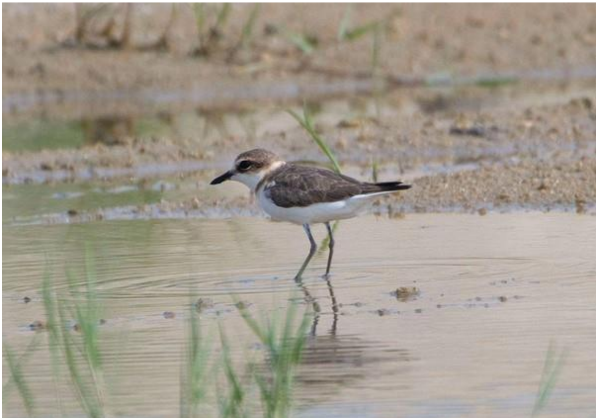
Javan Plover, Charadrius javanicus at Pulau Tekong on 16 July 2021.

Two birds photographed on 16 July 2021 at Pulau Tekong by Frankie Cheong were the first record for Singapore and mainland Southeast Asia. Prior to this record, the Javan Plover was recorded from South Sumatra, Java east to the Lesser Sundas. In addition, examination of photos taken in June at the same site revealed three birds including a juvenile. This indicates probable breeding in Singapore or somewhere nearby. One individual was still present at the site on 15 September. Amazingly, another individual was also seen at the Marina East breakwater on 17 December 2021 by Pary Sivaraman, the second record for Singapore and the first from the Singapore mainland.