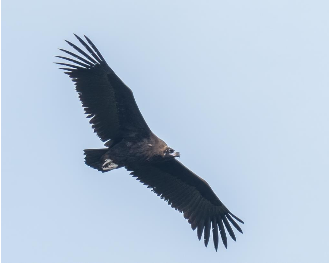
Cinereous Vulture Aegypius monachus at Singapore Botanic Gardens, 29 Dec 2021.

Chairman, Nature Society (Singapore) Bird Group Records Committee.