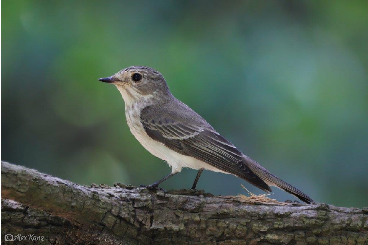
Spotted Flycatcher Muscicapa striata at Kent Ridge Park on 15 Oct 2021.

One photographed at Kent Ridge Park on 15 October 2021 by Alex Kang was the first record for Singapore. It breeds most of Europe and the Palearctic and winters in Africa and south-western Asia. Five subspecies are known.