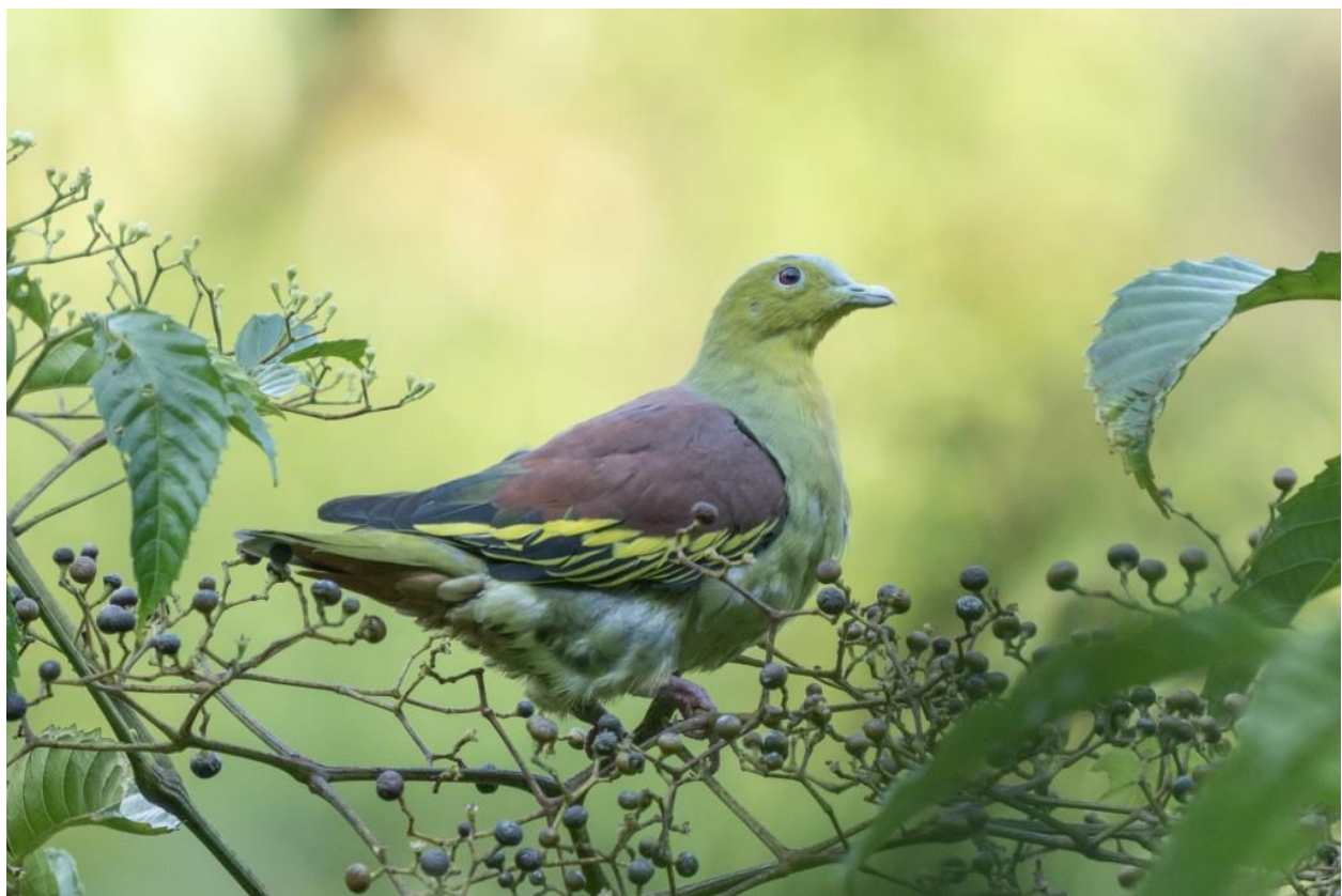
Ashy-headed Green Pigeon Treron phayrei at CCNR on 9 Oct 2021.