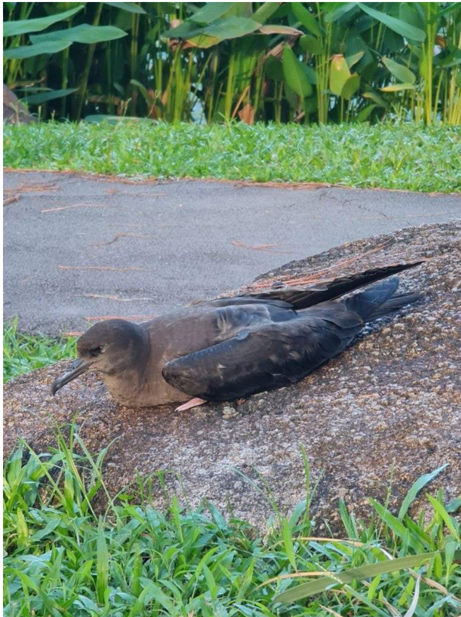
Wedge-tailed Shearwater Ardenna pacifica at BAMK Park on 23 June 2021.