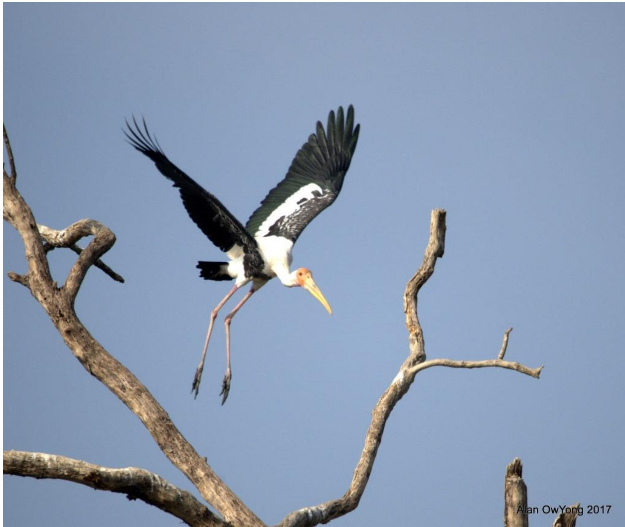
Painted Stork Mycteria leucocephala .

Previously in Category E (Lim 2009). The Painted Stork is a monotypic species ranging from the Indian Subcontinent to South China and Southeast Asia (Clements 2007). It is a common escapee, presumably from free-flying stock from the Zoo, first reported in Singapore at Senoko on 29 March 1987 (Lim 2009). Subsequently, sightings have become frequent in coastal wetlands in the north and north-west of Singapore, especially at Sungei Buloh Wetland Reserve. Like the preceding species, breeding has not yet been reported outside the Zoo but juveniles have been seen. Hybrids with the previous species are common and care should be taken to separate them.