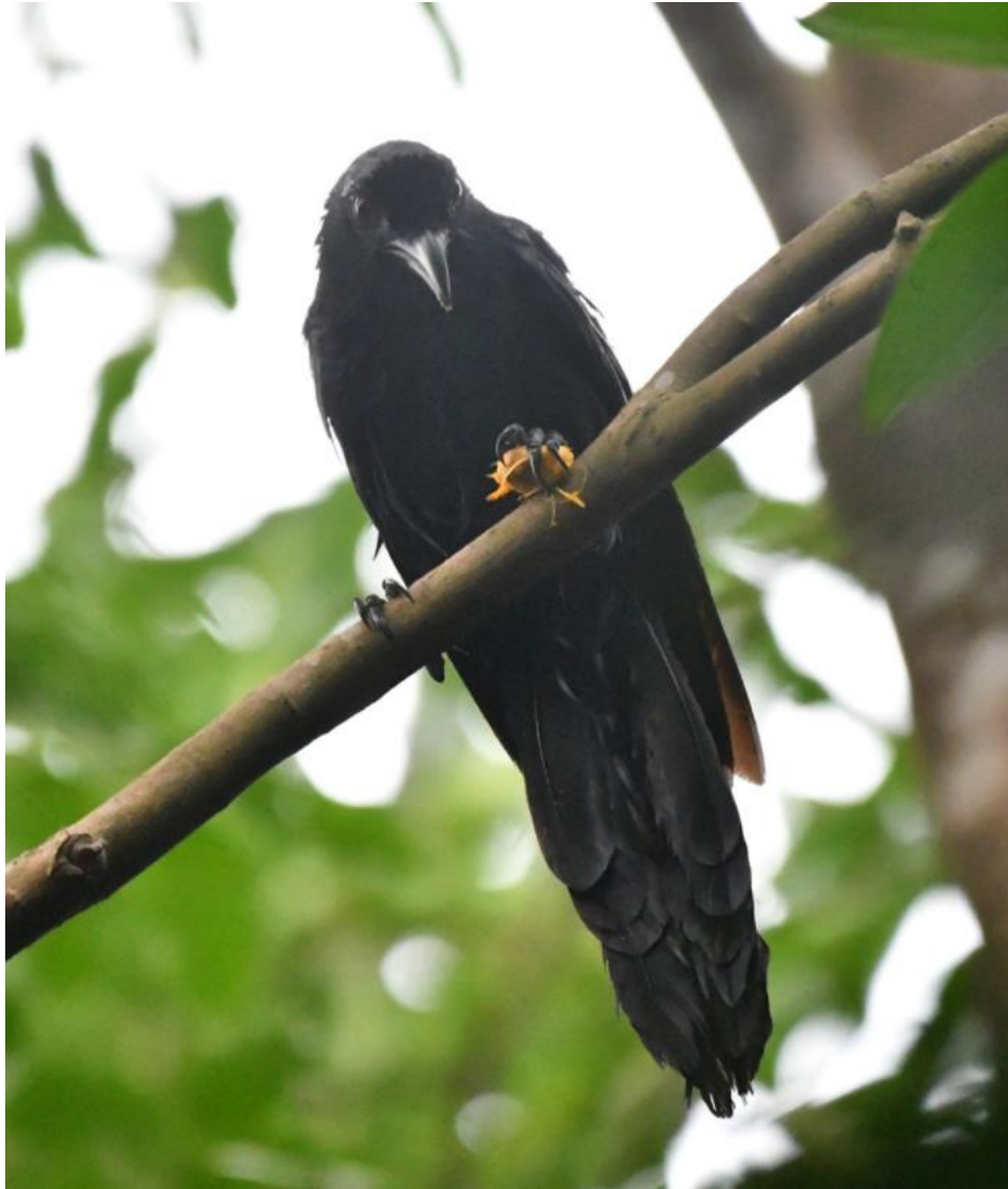
Malayan Black Magpie Platysmurus leucopterus at Hindhede Quarry on 9 June 2021.