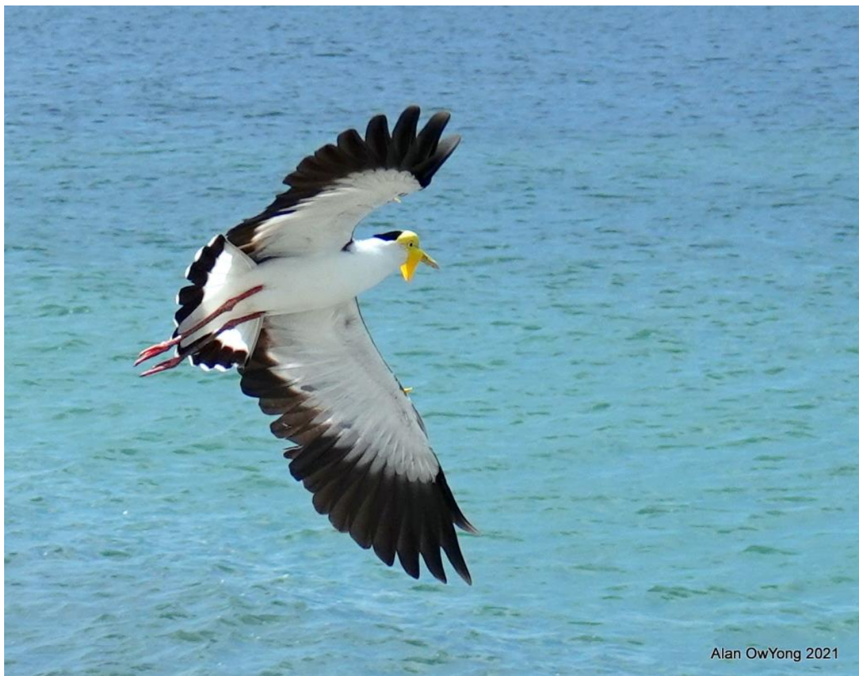
Masked Lapwing Vanellus miles at Marina East.

Previously in Category E (Lim 2009). A polytypic species ranging New Guinea, Australia and New Zealand, the Masked Lapwing was first recorded in Singapore when four birds were sighted at Lower Peirce Reservoir on 3-9 September 1994 (Lim 2009). They were believed to be escapees from the nearby Zoo. Subsequently, there were reports from other parts of the Central Catchment Nature Reserve, Kranji Reservoir, Lower Seletar Reservoir, Seletar Country Club, Tanah Merah and Marina East. The first breeding record was from Seletar Country Club on 24 November 2004 and, more recently, chicks have been seen at Marina East. This Australasian species appears established in the localities listed and is therefore added to Category C.