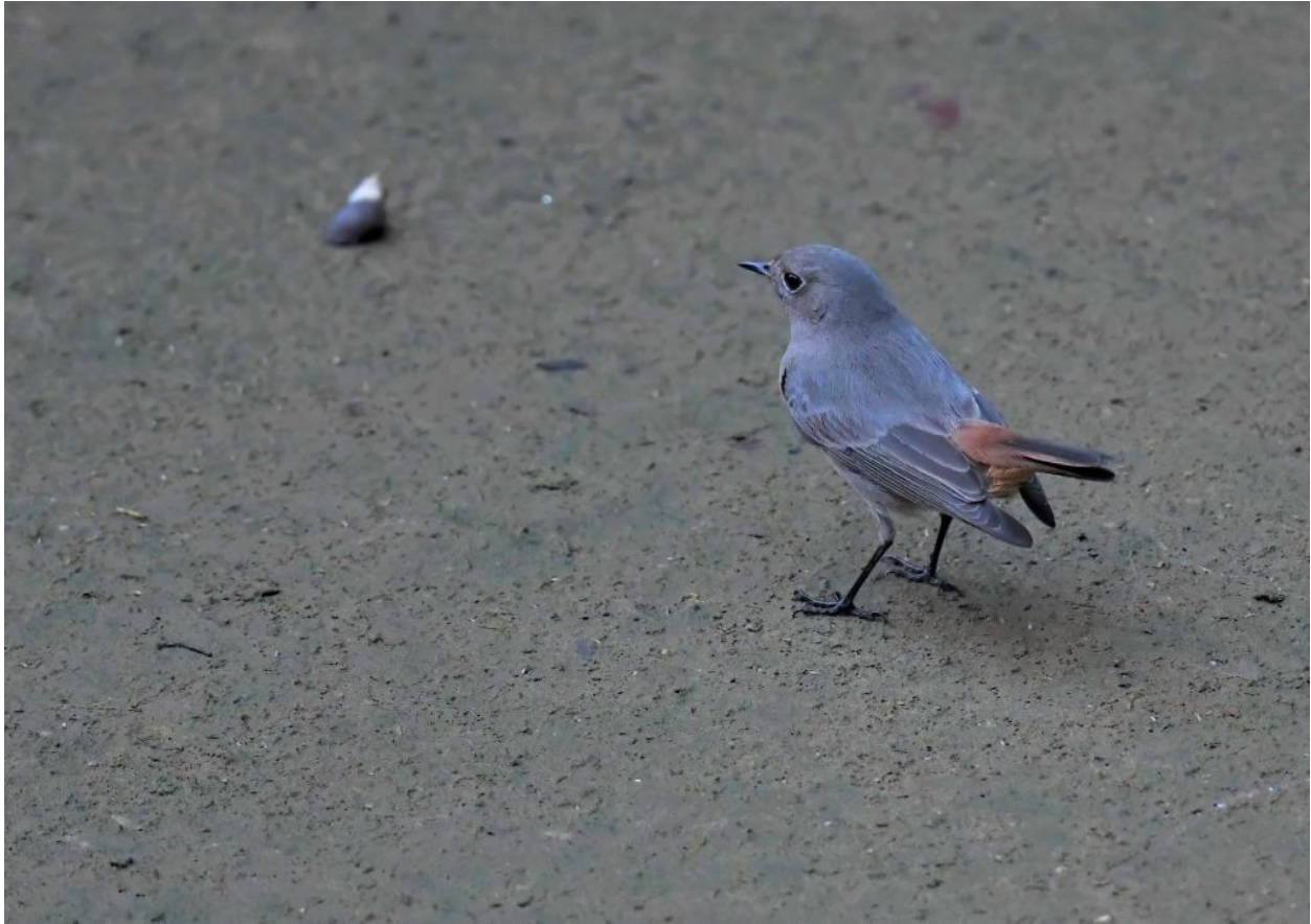
Black Redstart Phoenicurus ochrorus at Springwood Walk on 6 Dec 2021.

One female seen at Springwood Walk on 28 November 2021 by Ian Cash was initially identified as a Daurian Redstart. It was seen again 6 December 2021 by Art Toh who correctly identified it as a Black Redstart. This is a widespread breeder in Europe, Asia and northern Africa. Northern populations are migratory and winter in southern and western Europe and Asia, and north-west Africa, south to Morocco and east to central China. Between five and seven subspecies are known to exist.