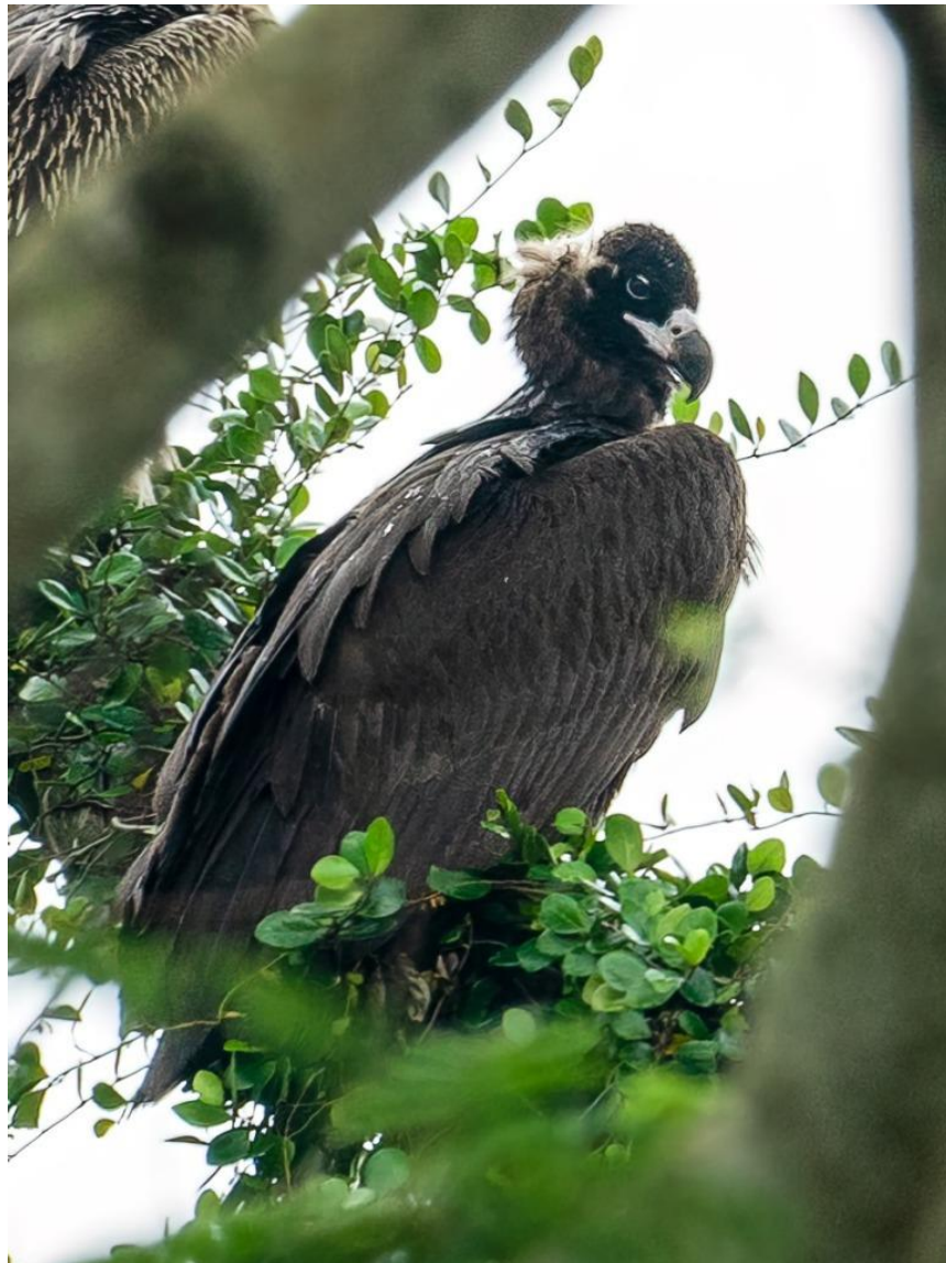
Cinereous Vulture Aegypius monachus at Singapore Botanic Gardens on 30 Dec 2021.