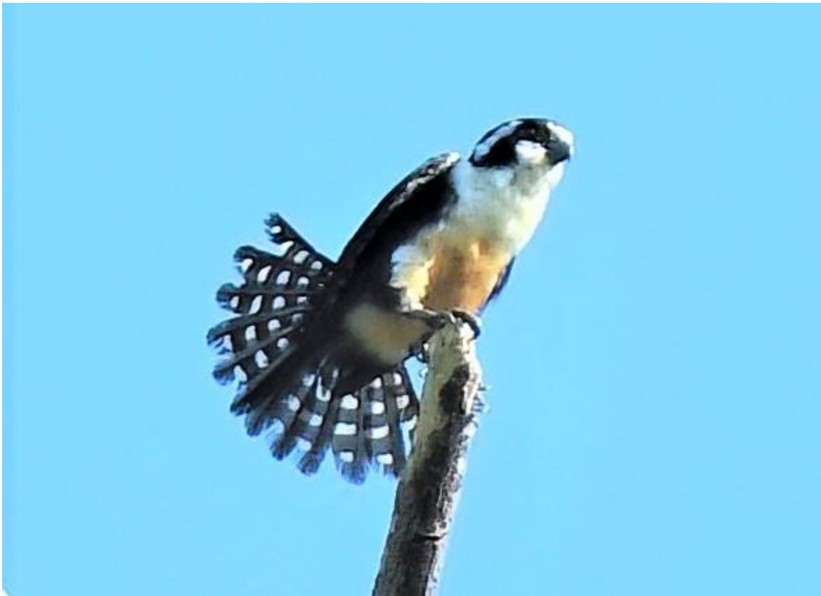
Black-thighed Falconet Microhierax fringillarius at Goldhill Ave on 20 May 2021.